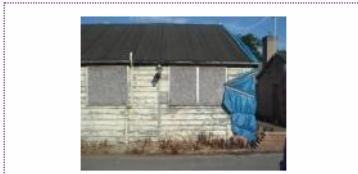
One of the huts at Bletchley Park